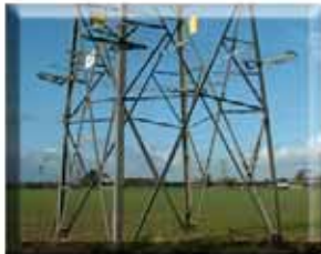
132kV TOWER ANTI-CLIMBING DEVICES