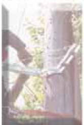
Opening Wood Pole ACD

OLF also offer a unique opening wood pole ACD allowing climbing without the removal of the barbed wire and subsequent re-wiring. For barbed wire and accessories see page D54.