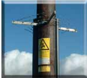
WOOD POLE ANTI-CLIMBING DEVICES