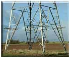
275kV AND 400kV NGC TOWER ANTI-CLIMBING DEVICES