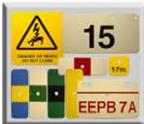
NOTIFICATION PLATES AND ACCESSORIES