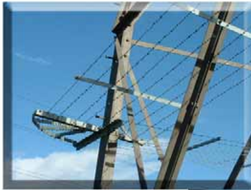
275kV AND 400kV NGC TOWER ACD's