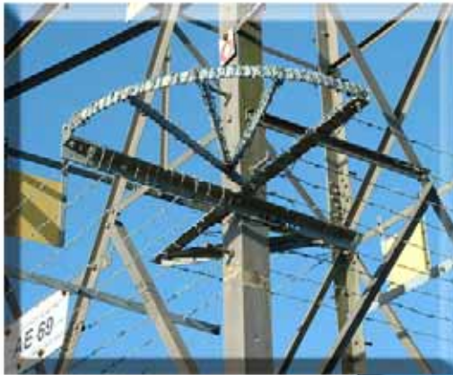
132kV TOWER ACD's