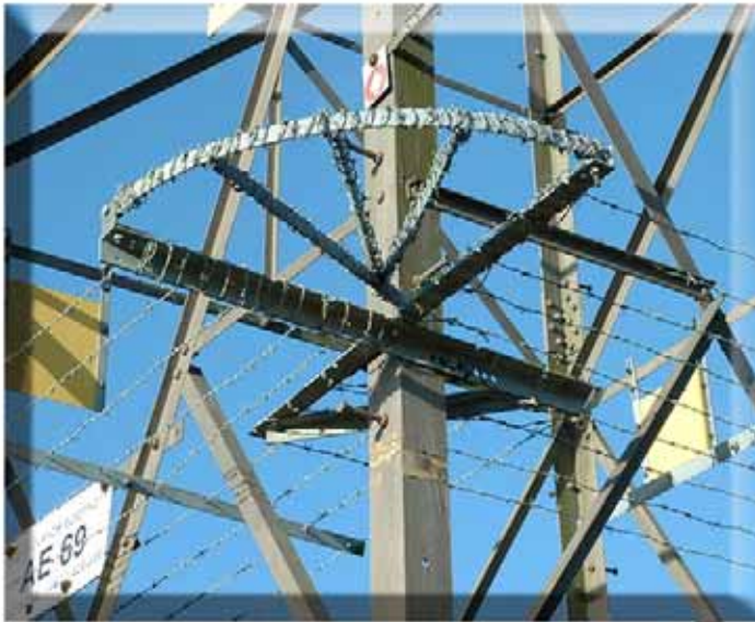
BARBED WIRE AND ACCESSORIES