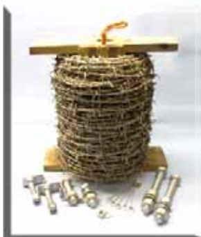
BARBED WIRE AND ACCESSORIES